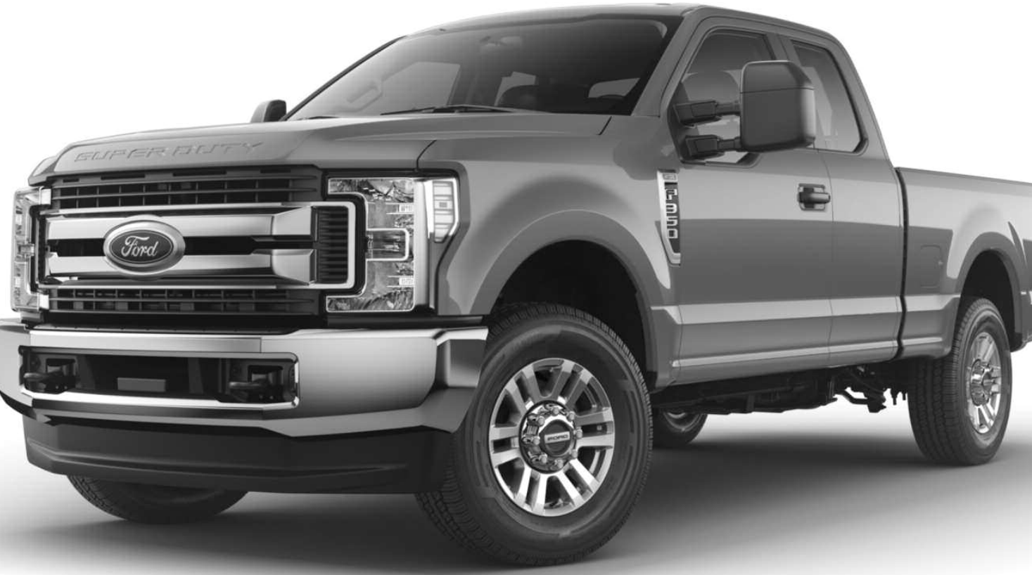
The STX Appearance Package will be available for 2017 F-150 and Super Duty trucks, building on the success of the previous generation F-150 STX. This will be the first time F-Series Super Duty is offered with the STX package.