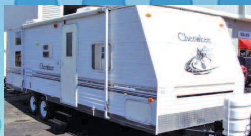
USED 2003 CHEROKEE 28 A TRAVEL TRAILER Bunkhouse, sleeps 8, slideout. Regular $6,995. SALE PRICE $5,495

HOURS: Monday – Friday 9:00 – 5:30 | Saturday 9:00 - 2:00 | Sunday: Closed