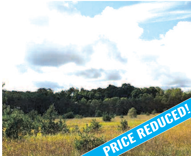
N CAMP TEN ROAD, ELMIRA

Great place to build a home or use for deer camp. 40 acres that is 2/3 wooded and has mixed trees on the property with a nice building site up front. MLS 446148. $44,500. Ask for Mike Stark or Holly Nierman.