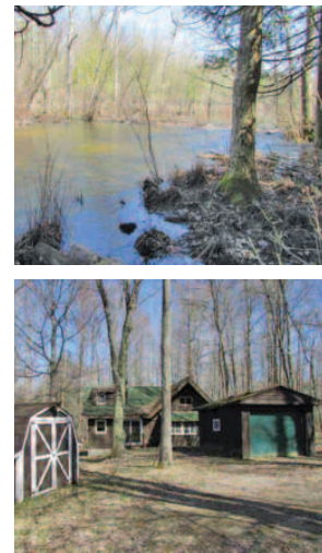
N CAMP TEN ROAD, ELMIRA