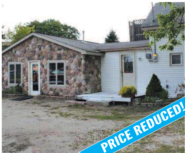
401 WATER STREET • EAST JORDAN