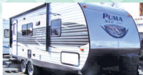
NEW 2017 PALOMINO PUMA XLE 21FBC TRAVEL TRAILER Slideout, front bedroom. MSRP $23,294. SALE PRICE $15,995 Payments as low as $129 a Month.

Here are couple of Hot Deals on New RV's priced like Used ones