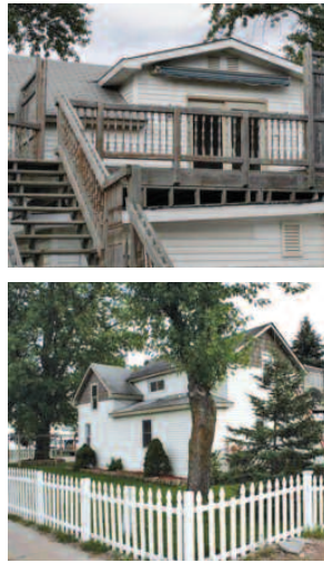
2268 ECHO LANE • EAST JORDAN