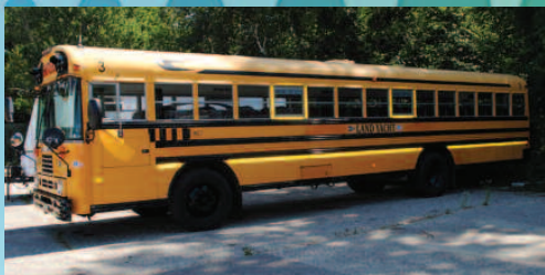
2002 BLUEBIRD 52 PASSENGER BUS Automatic. SALE PRICE $6,495