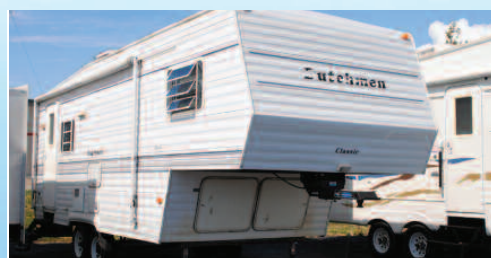
USED 1998 DUTCHMEN 240 5TH WHEEL Slideout. Regular $3,995. SALE PRICE $2,495