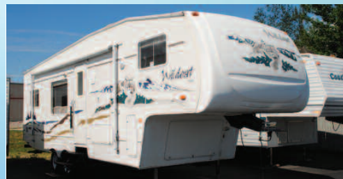
USED 2006 WILDCAT 28RK 5TH WHEEL Slideout. Regular $12,995. SALE PRICE $9,995