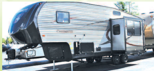
NEW 2016 FOREST RIVER RV CHEROKEE 255P 5TH WHEEL Limited pkg, pwr. awning, back-up camera. MSRP $34,311. SALE PRICE $22,995 Payments as low as $115 a Month.

2215 US31 N. PETOSKEY • 231-347-3200 www.petoskeyrvusa.com