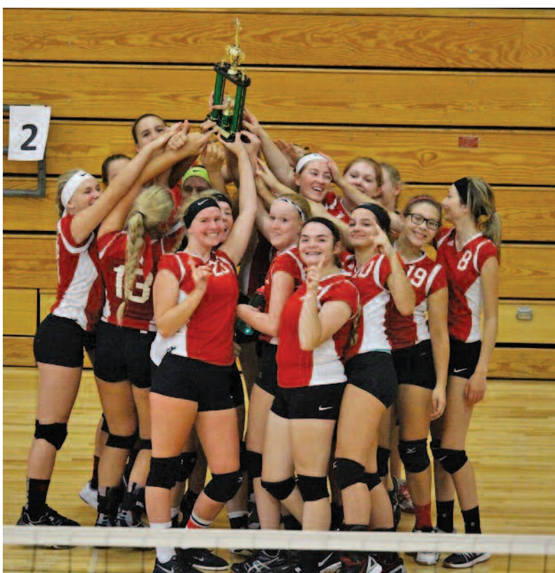
The East Jordan JV volleyball team hoists their Pellston JV Invitational trophy after taking home first place.