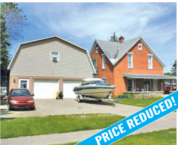
407 THIRD STREET, EAST JORDAN

Great place to build a home or use for deer camp. 40 acres that is 2/3 wooded and has mixed trees on the property with a nice building site up front. MLS 446148. $44,500. Ask for Mike Stark or Holly Nierman.