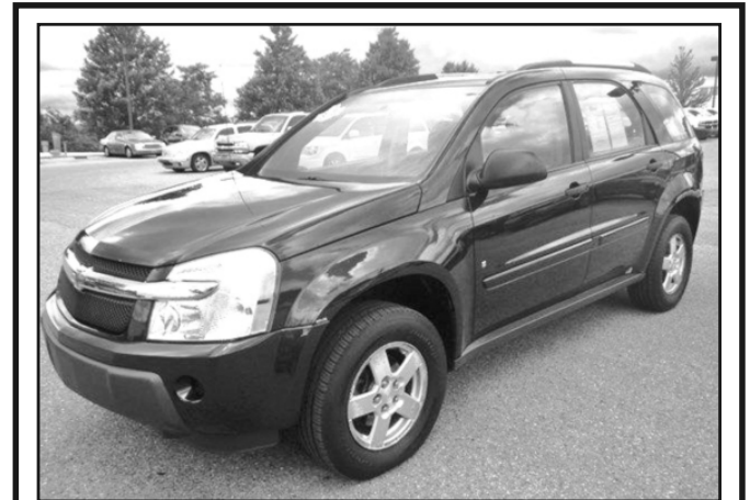
2006 Chevy Equinox LS AWD

SHADOW LANE, GAYLORD. Behind Walmart plaza. Puzzles, cake pans, clothing, men things, lots of misc. Starts Friday, Sept. 2 at 10am.