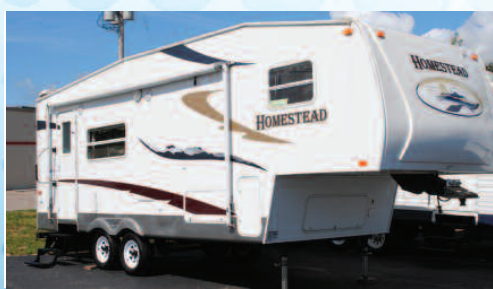
USED 2006 STARCRAFT HOMESTEAD LITE 240 RGS 5TH WHEEL Slideout. SALE PRICE $9,995