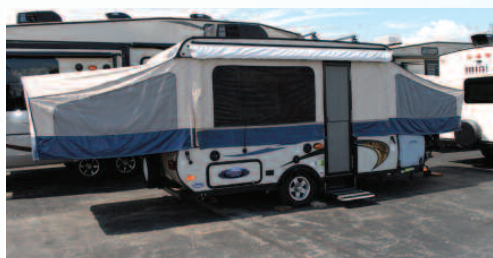
USED 2015 COACHMEN RV CLIPPER 285SST CLASSIC POP-UP CAMPER. 2 king size beds, side pop-out gives extra space, built in shower. Regular $13,995 SALE PRICE $9,995

We are clearing out all of our used RV's. Save Thousands of dollars on every Used RV in stock.