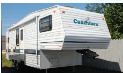
USED 1995 COACHMEN RV CATALINA 278RK 5TH WHEEL. Slideout, front kitchen queen bed. Regular $7,995. SALE PRICE $4,995